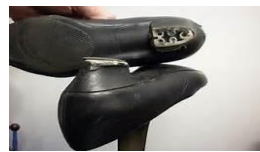
Ladies reg toplifts