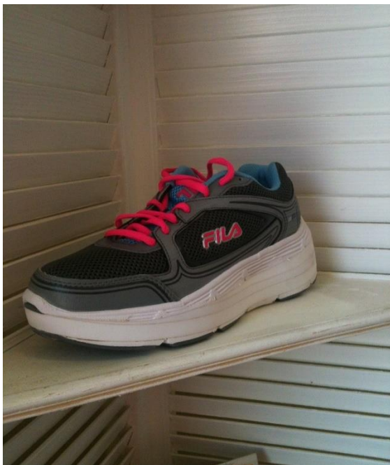
1/2" Shoe lift

What we do is split the sole at the bottom of any shoe of men, women, and children, add the build up to the specified size, taper at the toe, then reattach the original bottom of the shoe. This creates an aesthetically appealing look while alleviating pain in the foot, leg, hip, and back caused by the limb length discrepancy. In situations that the sole can't be split, we apply the buildup directly on the sole of the shoe and use a thin out soling material