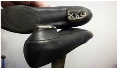
Ladies reg toplifts