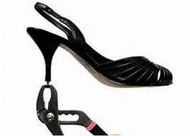
Ladies dowel heels

Ladies' Heel may be made of rubber, leather, or other material, serving as the thin layer that touches the ground and goes under the heel of the foot.